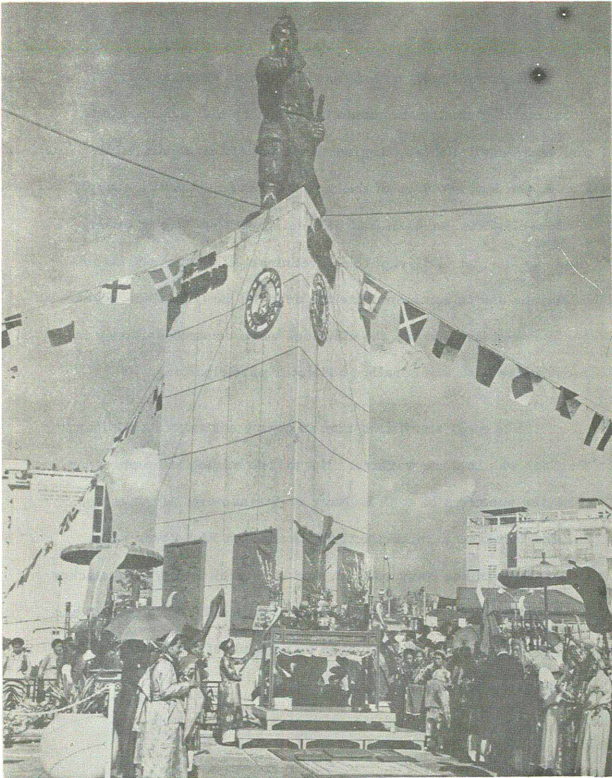
Members of Tran Hung Dao Association and Saigon citizens gather before a special alter at the waterfront statue of Gen. Tran Hung Dao, 13th century hero of Vietnam and patron saint of the Vietnamese Navy.