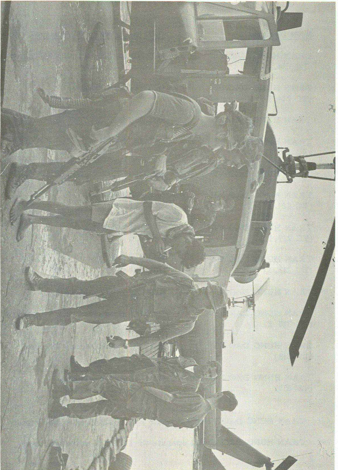
SEALS - A SEAL team just returned from a mission pauses for a smoke break prior to debriefing. The Vietnamese lighting his cigarette. In a Kit Carson Scout serving with the team. Kit Carson Scouts are former Viet Cong who have returned to the Government of Vietnam.